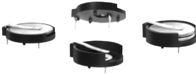
SINGLE CELL HOLDER (3-VOLT)